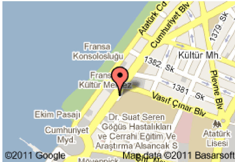
Fig. 3: The location of DESEM in Alsancak.

< http://www.deu.edu.tr/DEUWeb/Icerik/Icerik.php?KOD=16482 >.