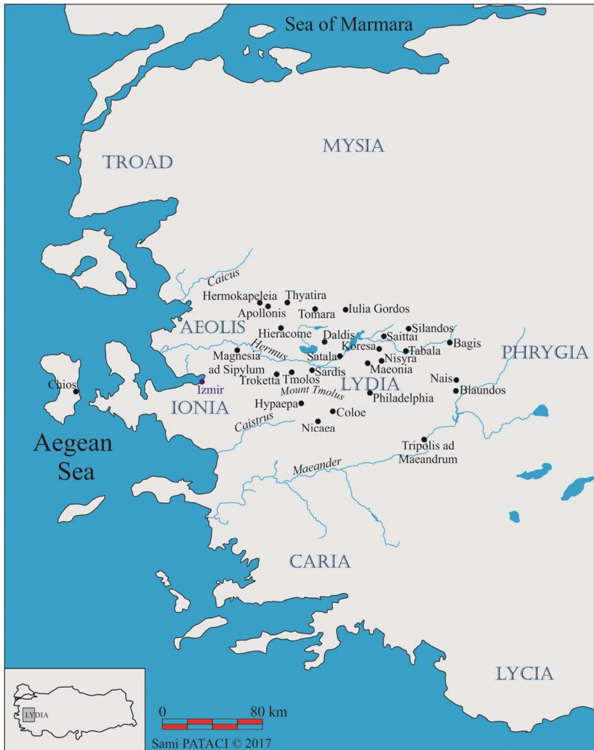
Fig. 4: Map of Lydia (Sami Pataci, 2017).